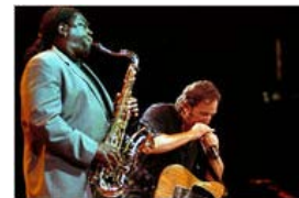
Read Related Posts • Music Section