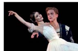
Read Related Posts • Dance Section