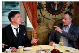
Read Related Posts • Television Section