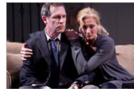
Read Related Posts • Theater Section