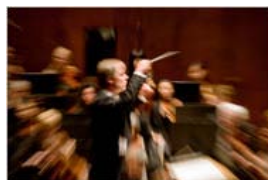
Read Related Posts • Music Section